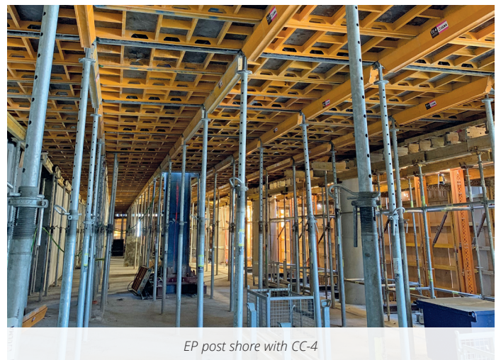
EP post shore with CC-4