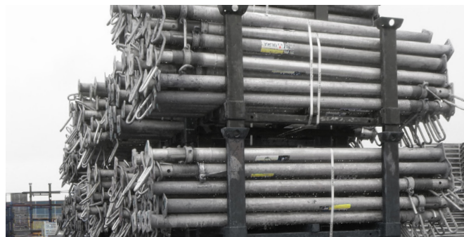
EP post shores ready for shipping