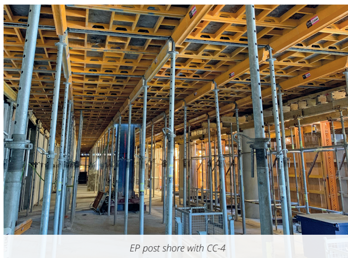
EP post shore with CC-4