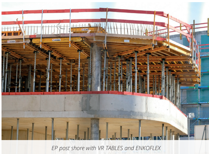
EP post shore with VR TABLES and ENKOFLEX