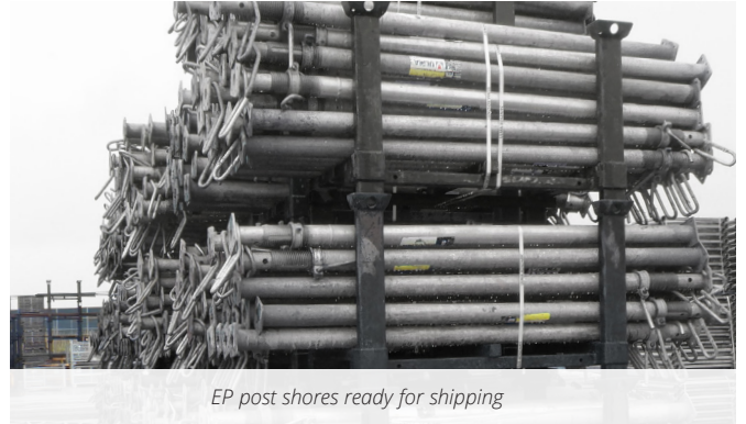
EP post shores ready for shipping