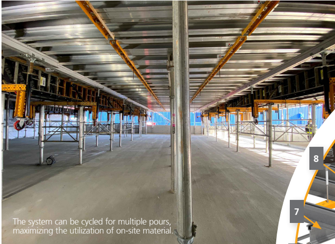
The system can be cycled for multiple pours, maximizing the utilization of on-site material.